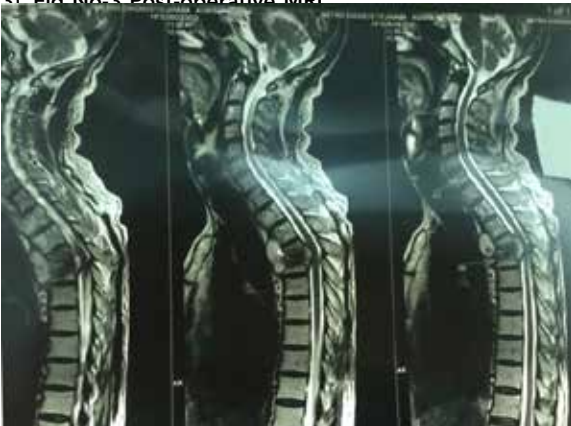
3) Fig No-3 Post-operative MRI